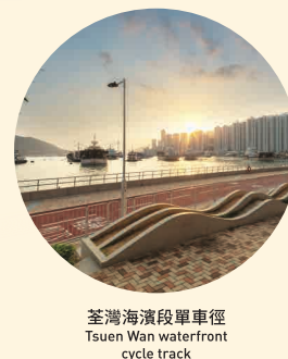
荃灣海濱段單車徑 Tsuen Wan waterfront cycle track